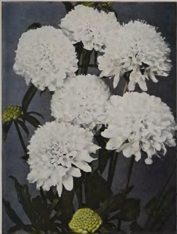
SCABIOSA, PEACE See description on page 27